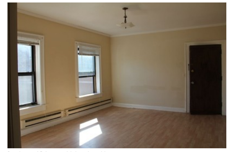
Dorchester LR larger with baseboard heat